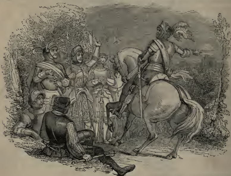
PERROT LE BEARNOIS AND A COMPANY OF PILLAGERS.—Designed from a MS. Illumination of the Fifteenth Century.

I will now return to Perrot le Béarnois and his companions. This same day, towards evening, they left Donzac, under the command of seven captains. Perrot le Béarnois was the chief, then the bourg de Copane, whose name was Arnaudon, the bourg Anglois, le bourg Carlat, Apton Seighin, Olim Barbe, and Bernadon des Isles: there was also with them a grand pillager from Béarn, called the lord de Lance-plaine. It was from him and the bourg de Copane I learnt all this business, and the manner of its being undertaken, after Candlemas, when the nights are long and cold. The weather this night was so severe, with wind and rain, that the captain of the guard would not leave his house, but sent his son, a boy about sixteen years old, to examine the state of the guard. On his arrival, between the outward